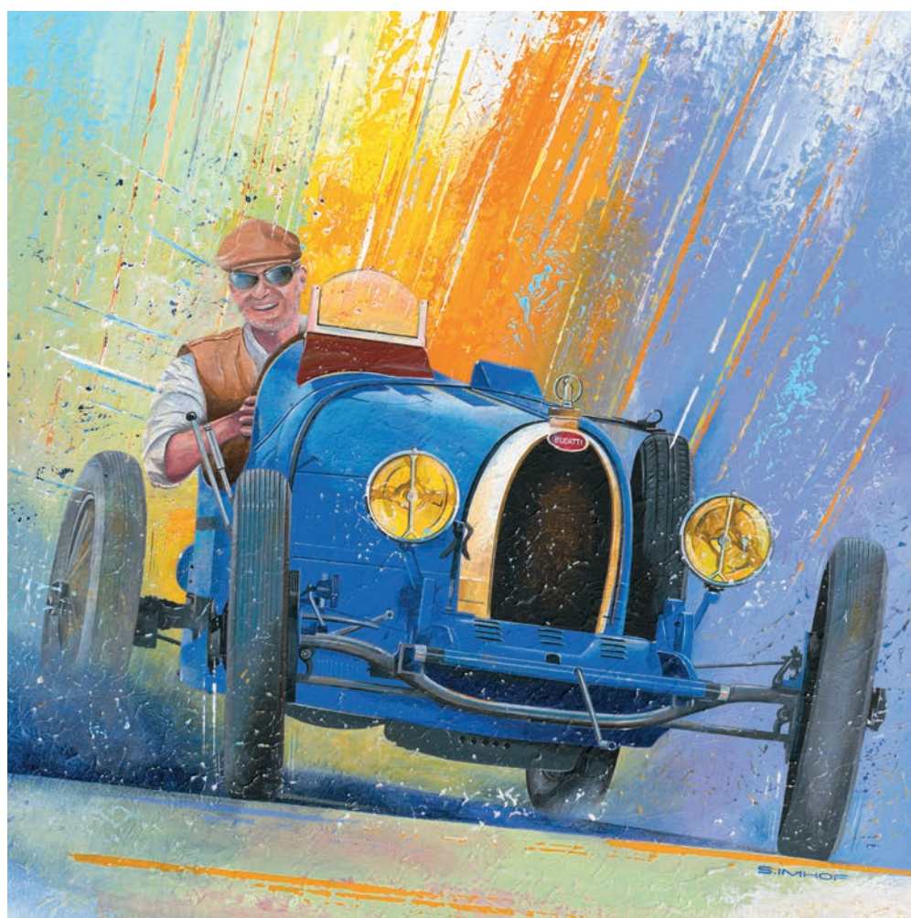
11 th Edition 26 th -28 th August 2022